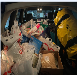
This is only a small portion of what has been provided!